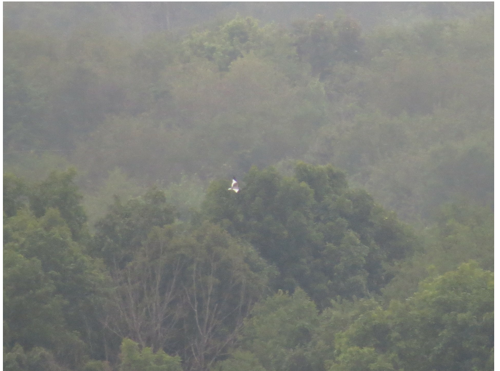
Sabine's Gull, Indiana, PA.JPG